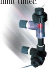
Optional accessories available for the Series CL include a dry contact flow switch with tee, or a complete flow assembly.

The Series CL provides conductivity monitoring and control with a Limit Timer that controls the feed time. Tower feed and bleed are initiated when the conductivity level reaches the user-specified set point. The programmable limit timer allows the operator to specify the maximum pumping time for the feed cycle. The Series CL includes a conductivity sensor, bleed relay and a user programmable limit timer.