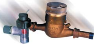
Optional accessories available for the Series WT include a dry contact water meter, flow switch with tee, or complete flow assembly.