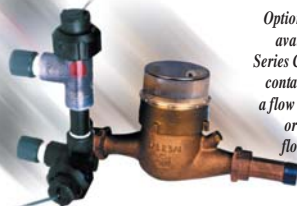
Optional accessories available for the Series CW include a dry contact water meter, a flow switch with tee, or a complete flow assembly.